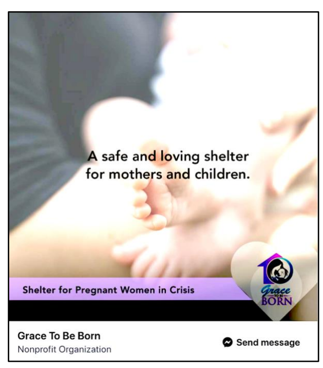
Grace To Be Born poster on its Facebook